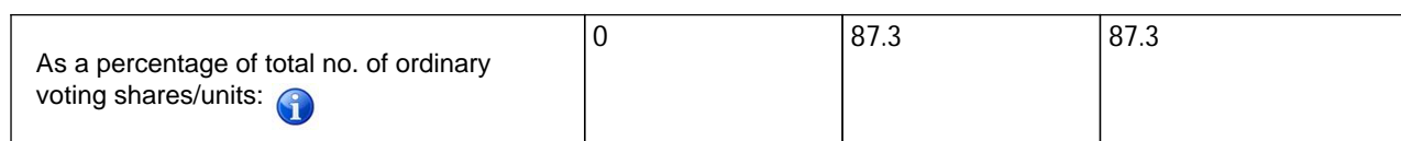
Table 8. Others