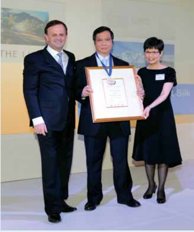
From left: PAL - Your child's first multi-media device that complements English-Time, At the SAPPI Printer of the Year 2012 Awards, Times Printers took home the Gold Award for the Book Printing 4C or more colour category