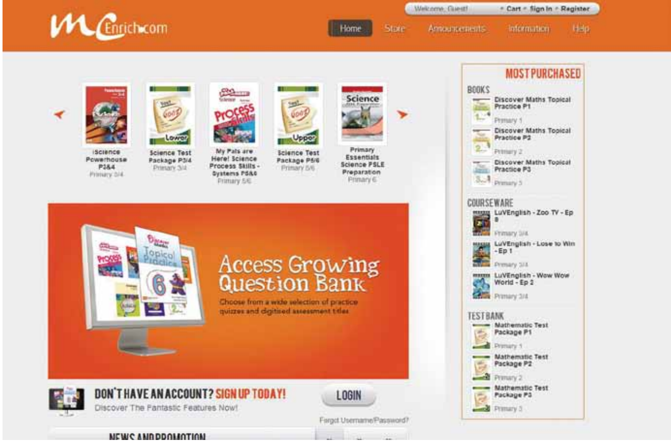
MCEnrich.com portal provides a full suite of online learning and enrichment resources